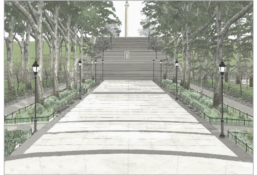
PWB proposal: a paved plaza