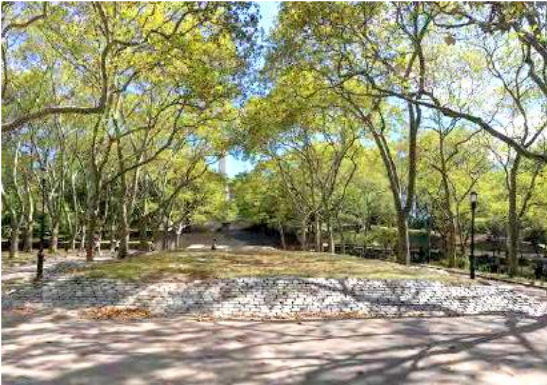
Fort Greene Park: Now