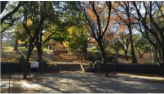
The northern perimeter of Fort Greene Park.

Fort Greene Park has won $5 million earmarked for capital improvements thanks to overwhelming public support received during the New York City Parks Department's Parks Without Borders initiative.