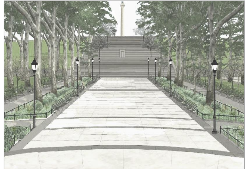
PWB proposal: a paved plaza